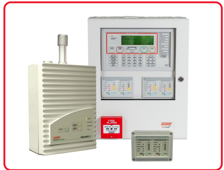
FireFinder Plus CIE cw Bar Graph Display (Australian CIE shown and may vary in regions)