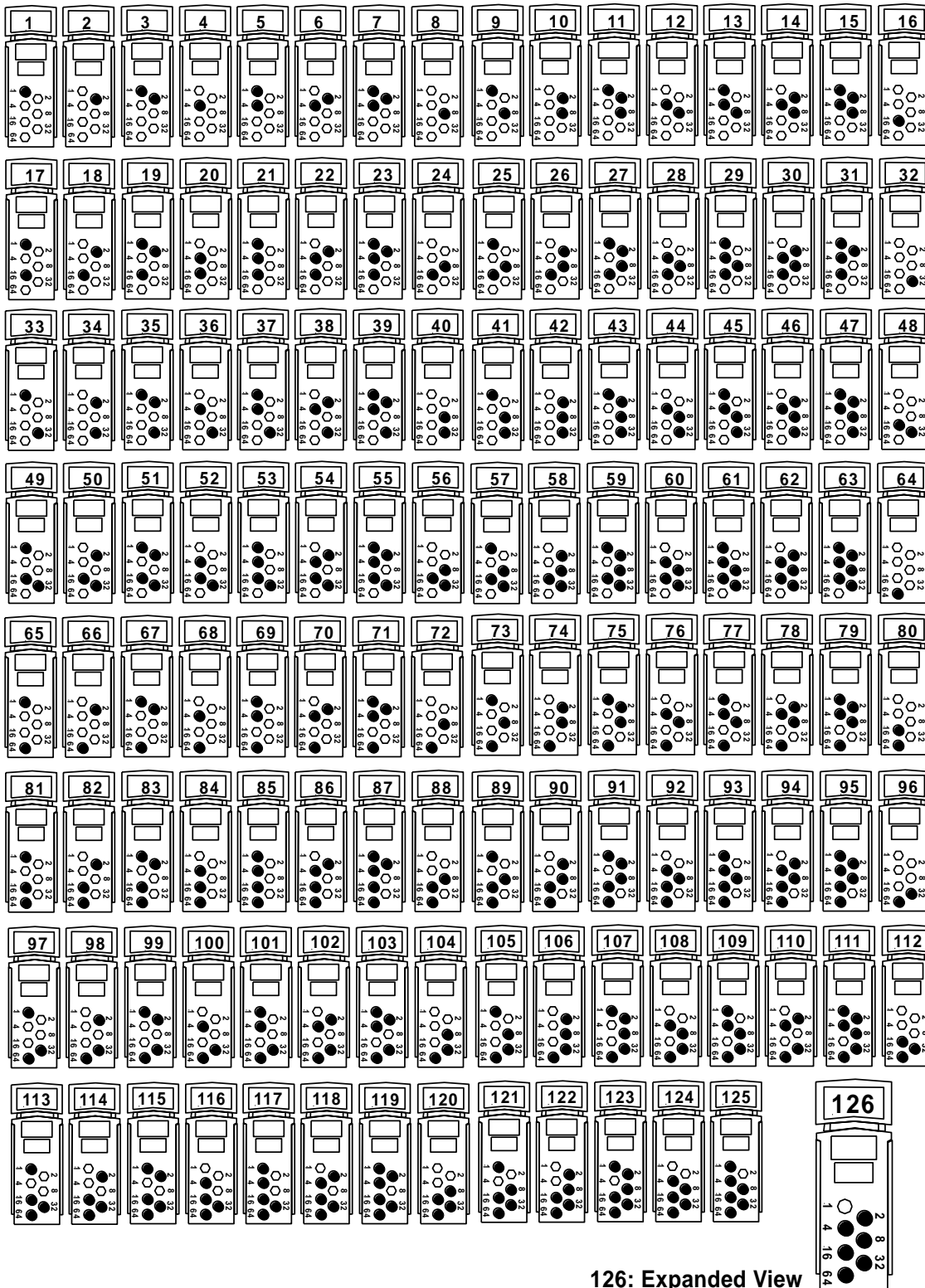
126: Expanded View

Select the desired address and remove the pips indicated in black. Remove pips with a small screwdriver.