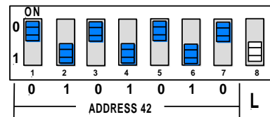
Figure 1: Example of Sounder Addressing and Sounder Output Level Setting

The address of the sounder is set using seven segments of the eight- segment DIL switch. The eighth segment is used to adjust the sounder output level. Segments 1- 7 of the switch are set to "0" (ON) or "1", using a small screwdriver or similar tool. A complete list of address settings is shown in on Page 3. If a detector is to be fitted, set the Xpert Card address as described on Page 2.