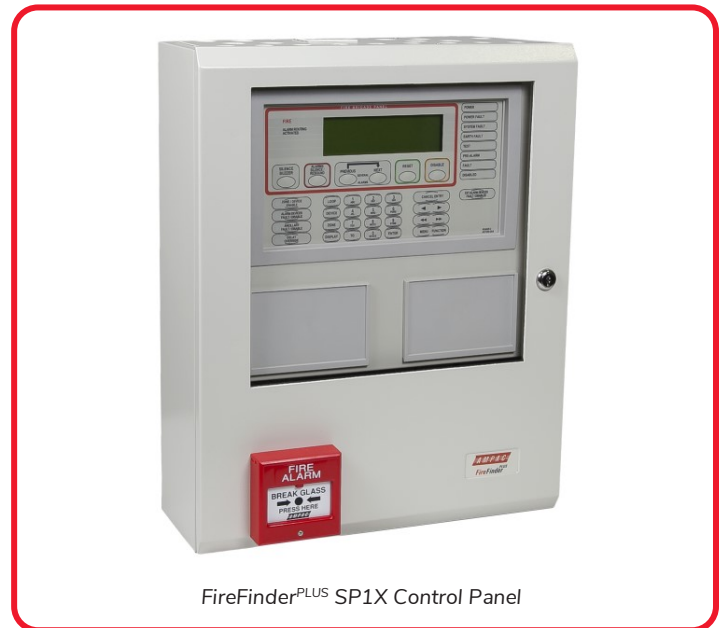
FireFinder PLUS SP1X Control Panel