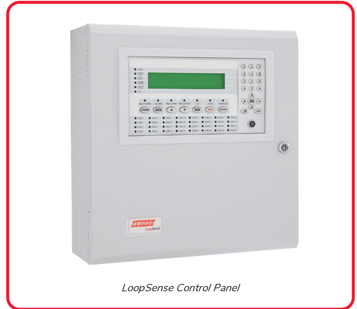
LoopSense Control Panel