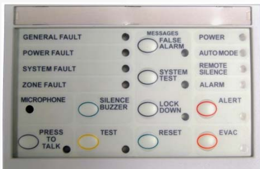
OWS Indicator & Control Module

The Single Zone Occupant Warning System is suitable for use in Ampac's FireFinder, LoopSense and ZoneSense Plus Fire Alarm Control Panels.