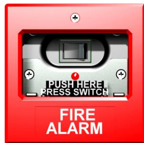
FACIA WITH THE OPERATION ELEMENT IN THE RELEASED POSITION