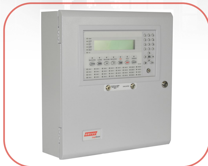
Figure 1: LoopSense BX11

The LoopSense includes the "Silence Alarm, Brigade Use Only" and "Evacuation" key operated switches as required by the NZ4512 standard.