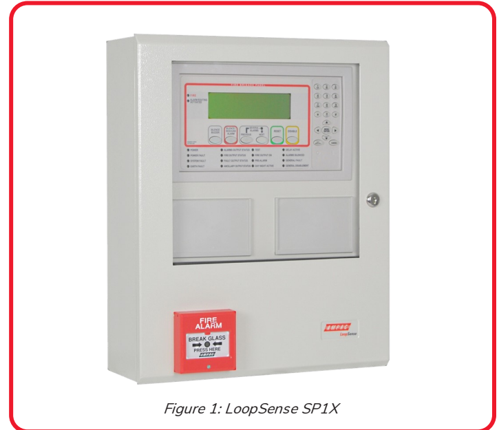
Figure 1: LoopSense SP1X