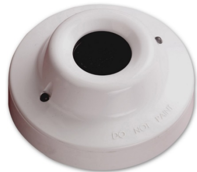
Illustration shows Triple IR Flame Detector

The triple IR flame detector is also fast reacting but is also tolerant of fumes, vapours, steam, dust and mist, while being unaffected by the phenomena listed above. It may, however, be affected by modulated IR radiation. Triple IR flame detectors are used in waste handling, colour printing and paper manufacturing.