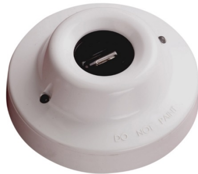
Illustration shows UV Flame Detector

They are fast reacting and respond to a flame more than 25m away. The UV flame detector is affected by arc welding, electrical sparks, lightning, nuclear radiation and UV light sources. For applications where these phenomena are present a UV flame detector should not be used.