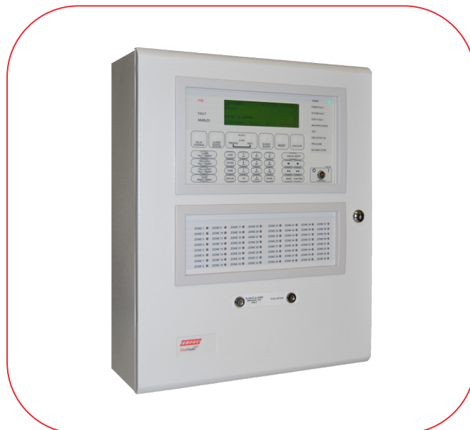
FireFinder Plus SP1M Control Panel

The FireFinder Plus is available in four standard cabinet options.