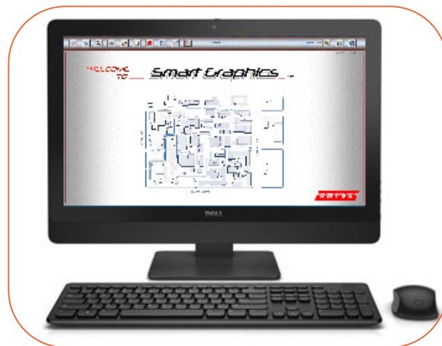
SmartGraphics HD Touch Screen

The Ampac SmartGraphics HD system can generate floor maps which show the seat and spread of the fire and an access map showing the preferred route to the fire event. These maps can be e-mailed to the emergency dispatch centre, and then forwarded to emergency response personnel whilst they are on route to the fire event