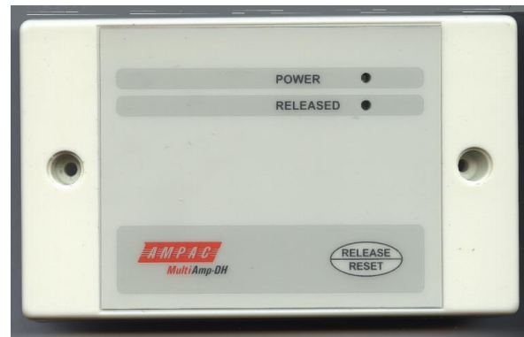
Figure 1: Front Panel Layout